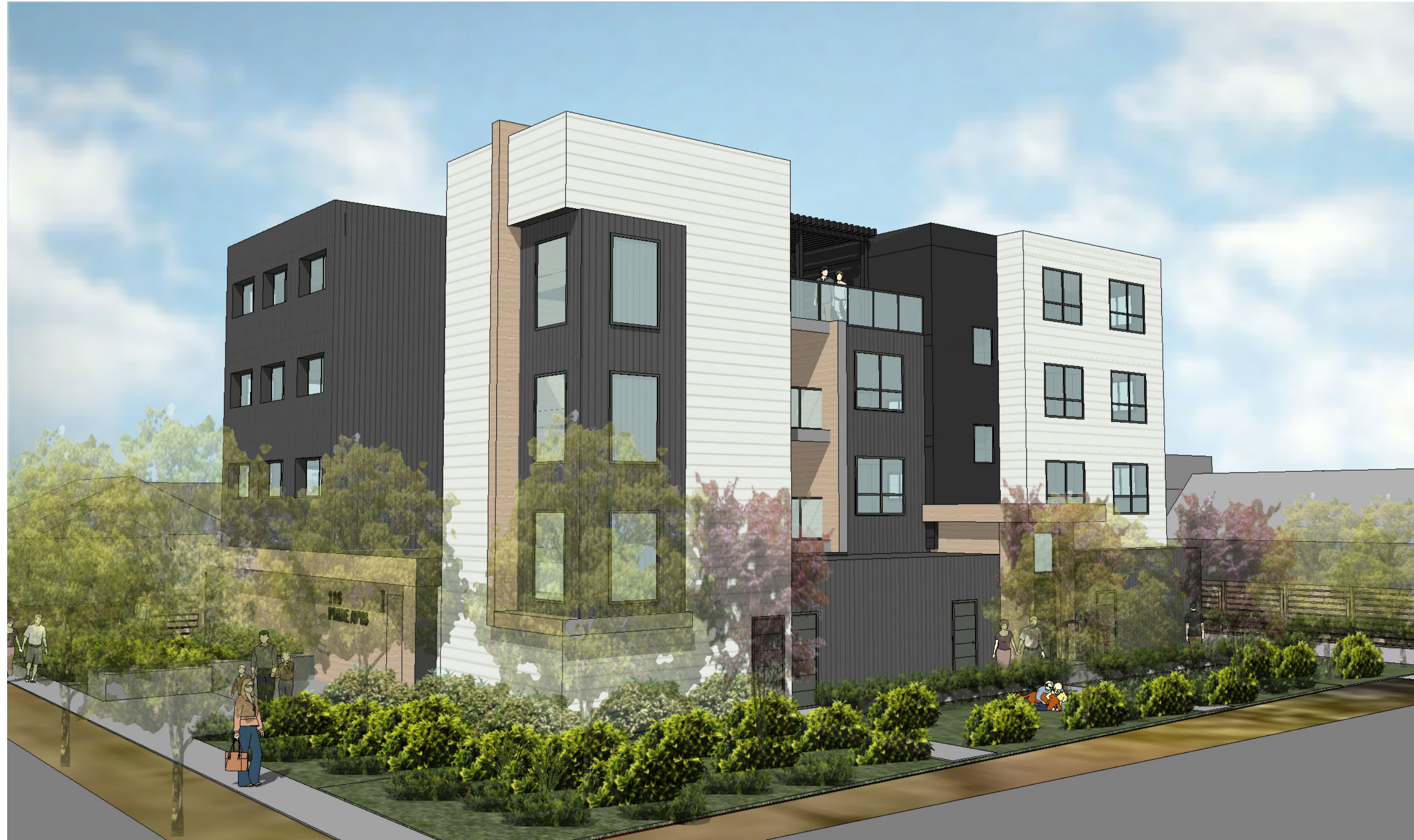
CORNER VIEW, PRYDE AND BARTLETT STREET