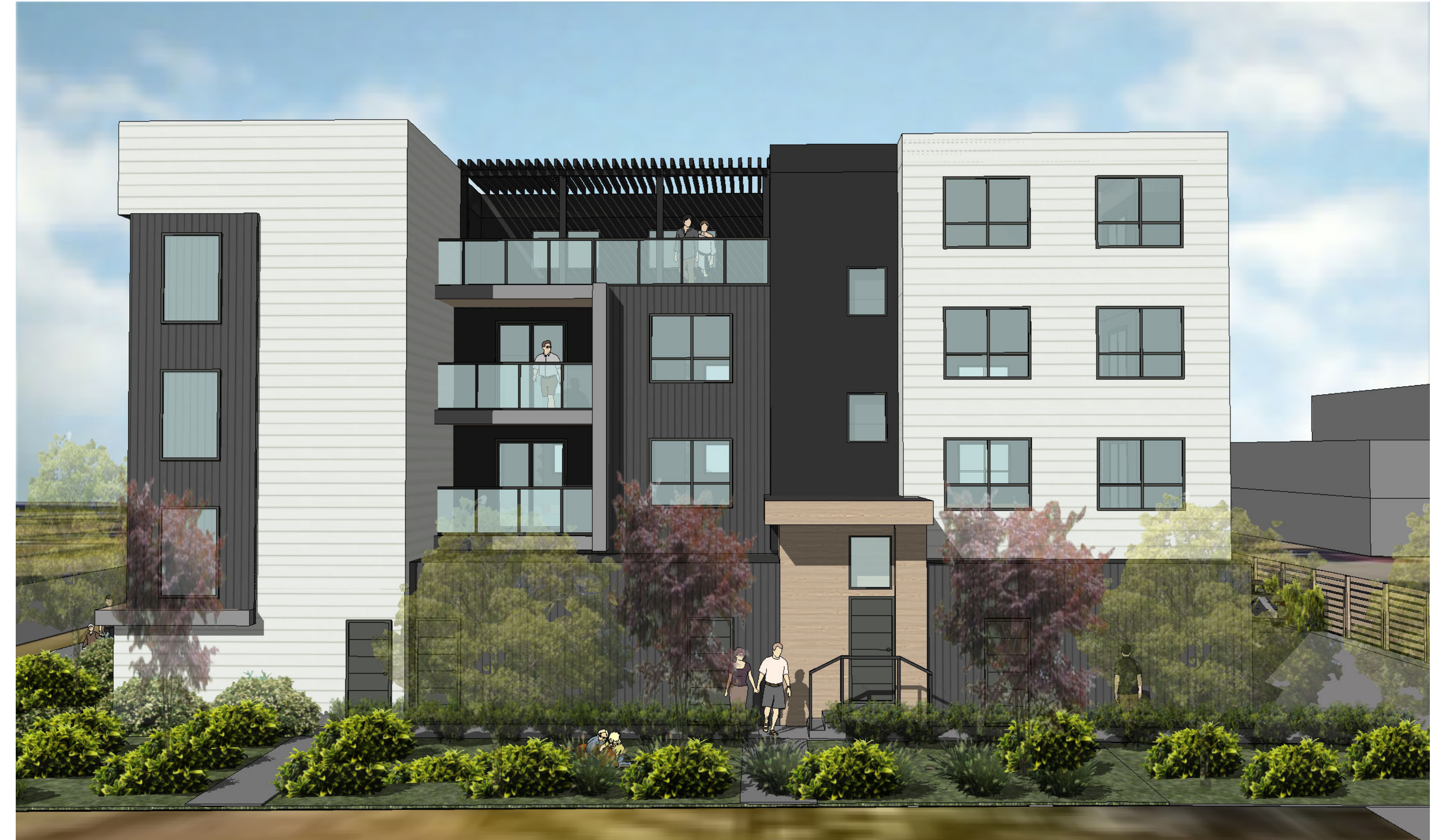
VIEW FROM BARTLETT STREET