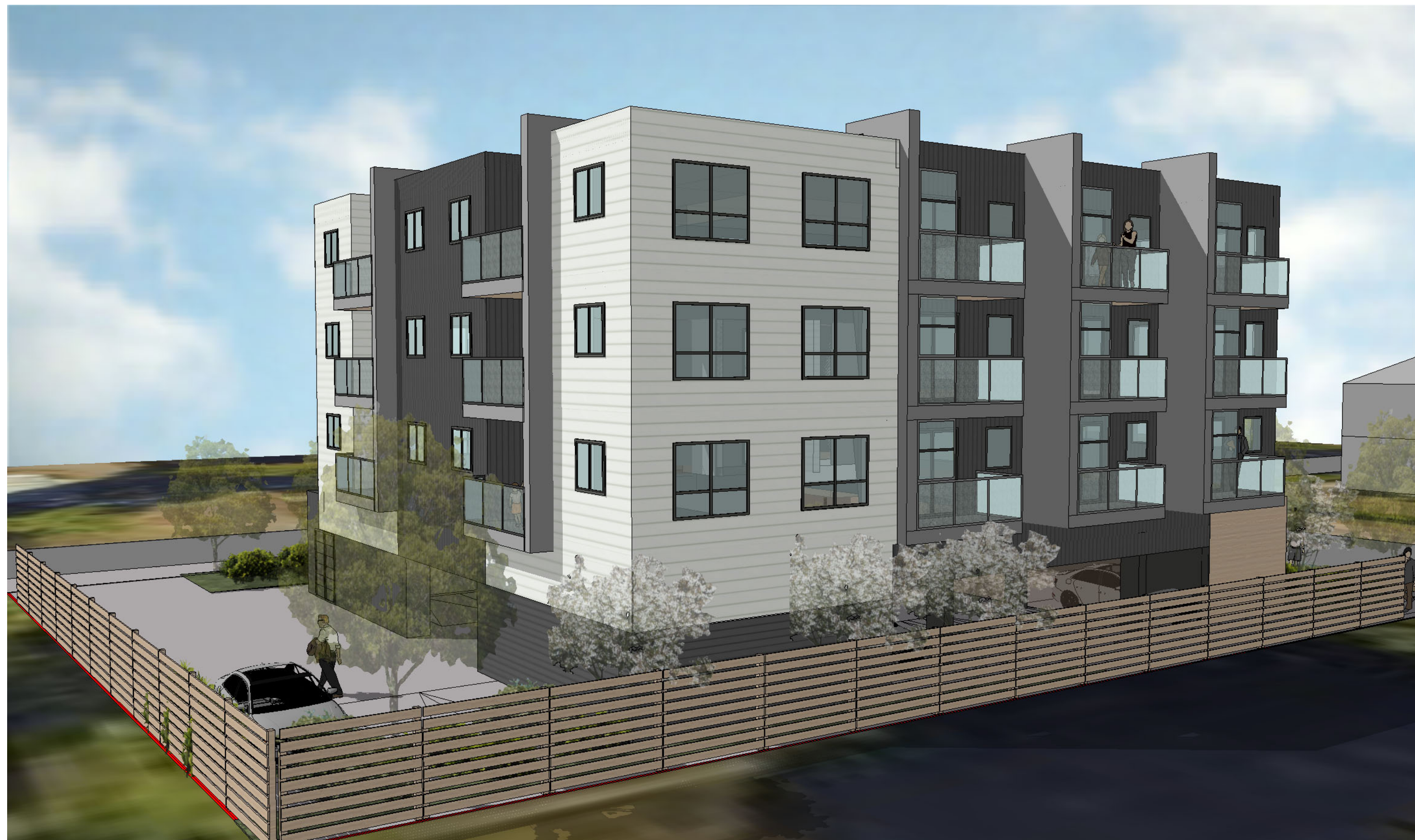
REAR VIEW OF BUILDING, EAST