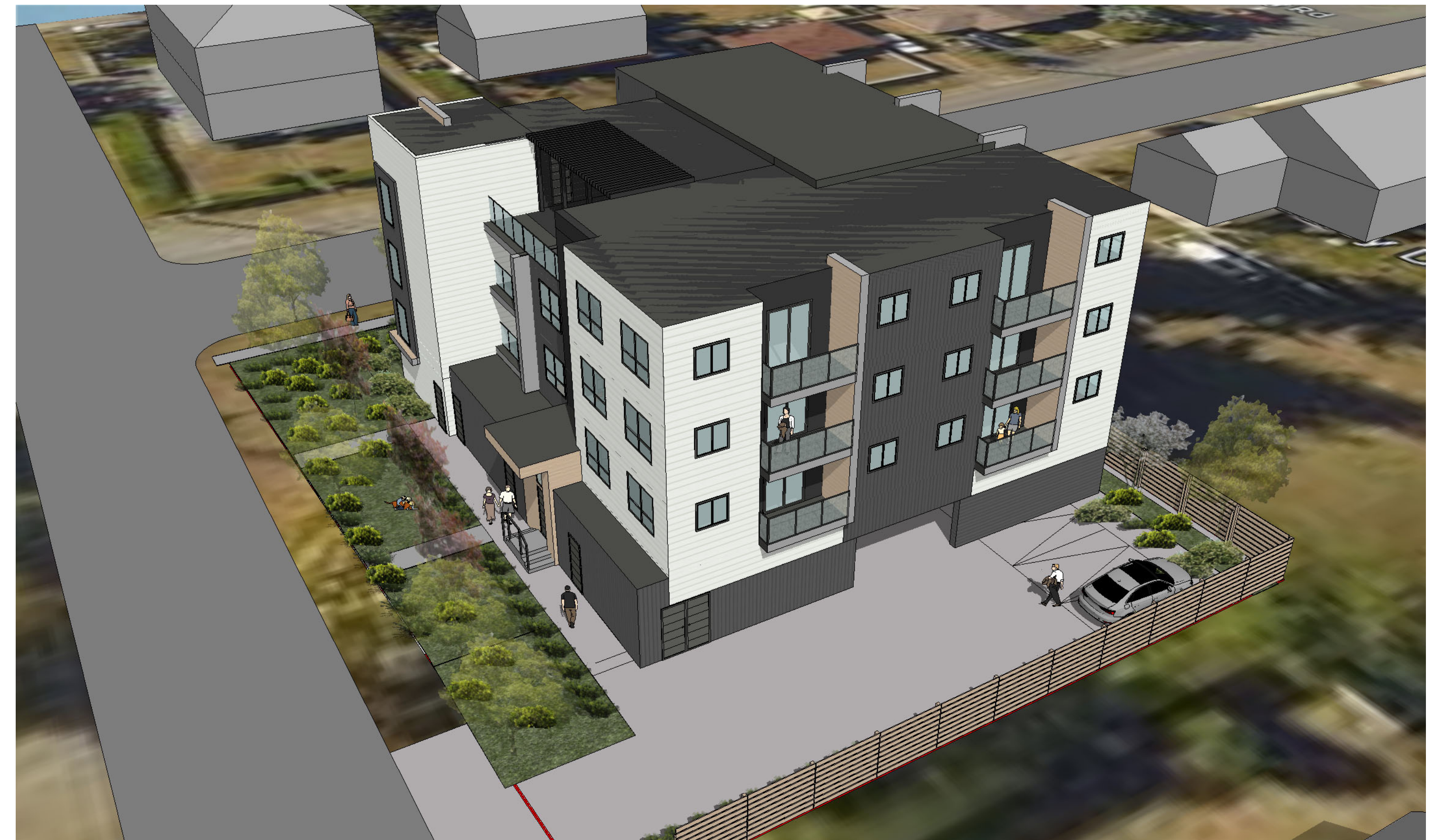
AERIAL VIEW OF SITE (REAR/ SOUTH SIDE)

RECEIVED DP1342 2024-APR-15 CURRENT PLANNING