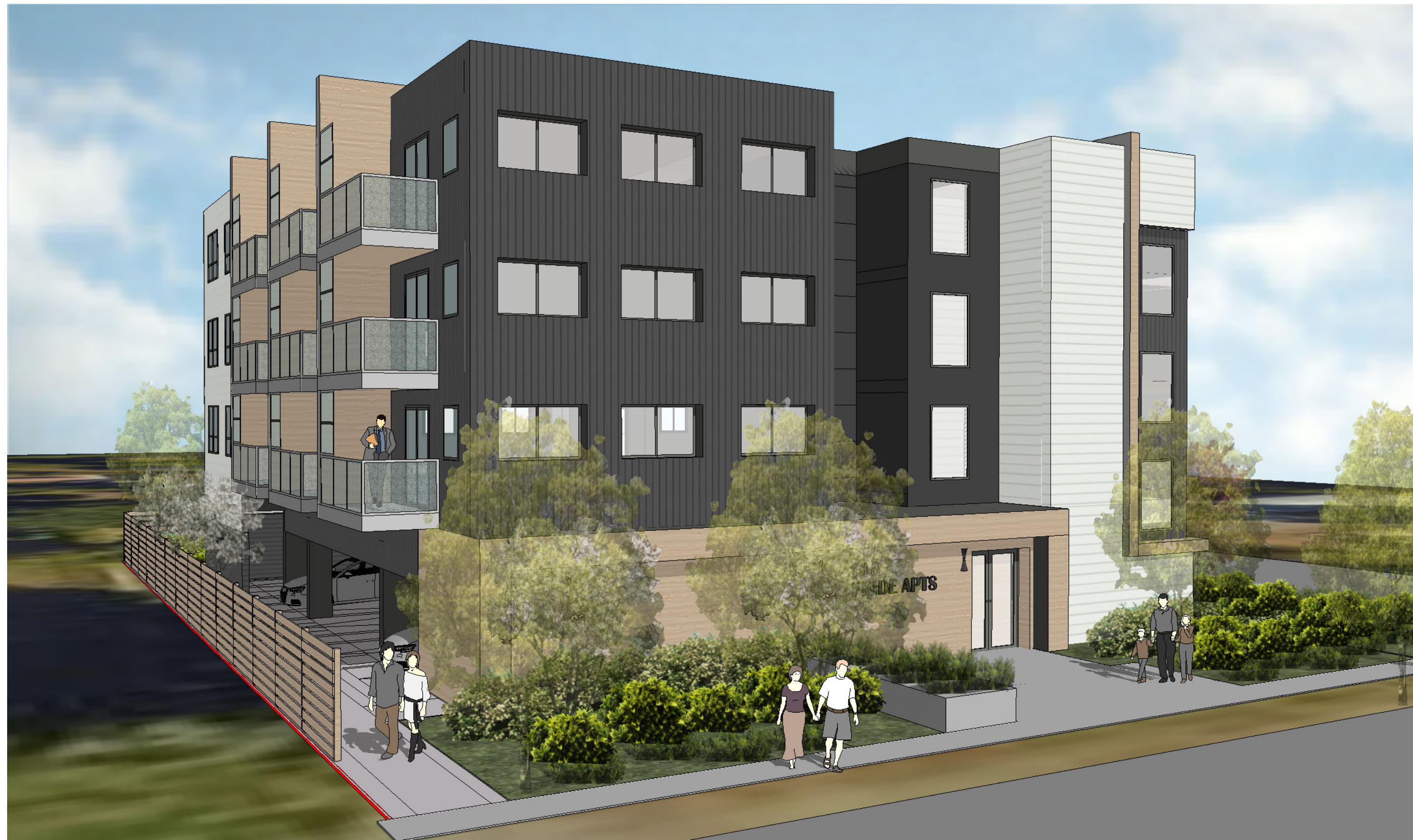
FRONT VIEW FROM PRYDE AVE