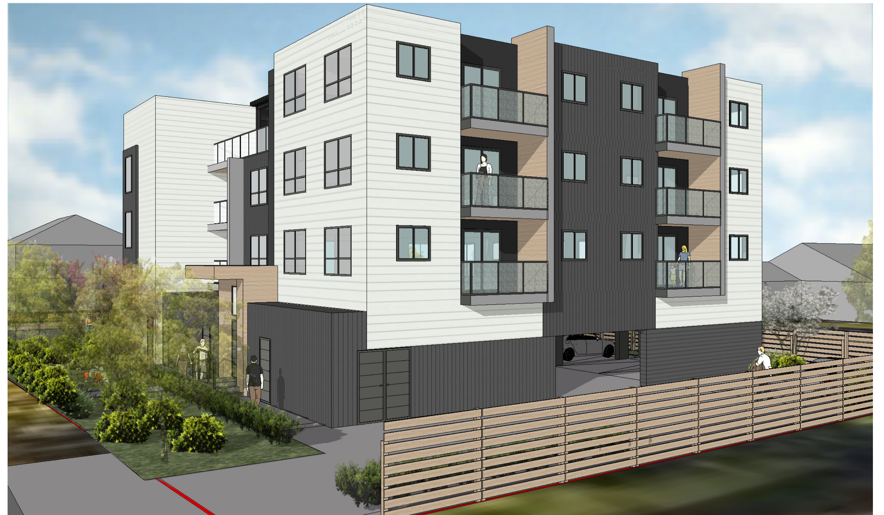
REAR VIEW OF BUILDING, WEST

RECEIVED DP1342 2024-APR-15 Current Planning