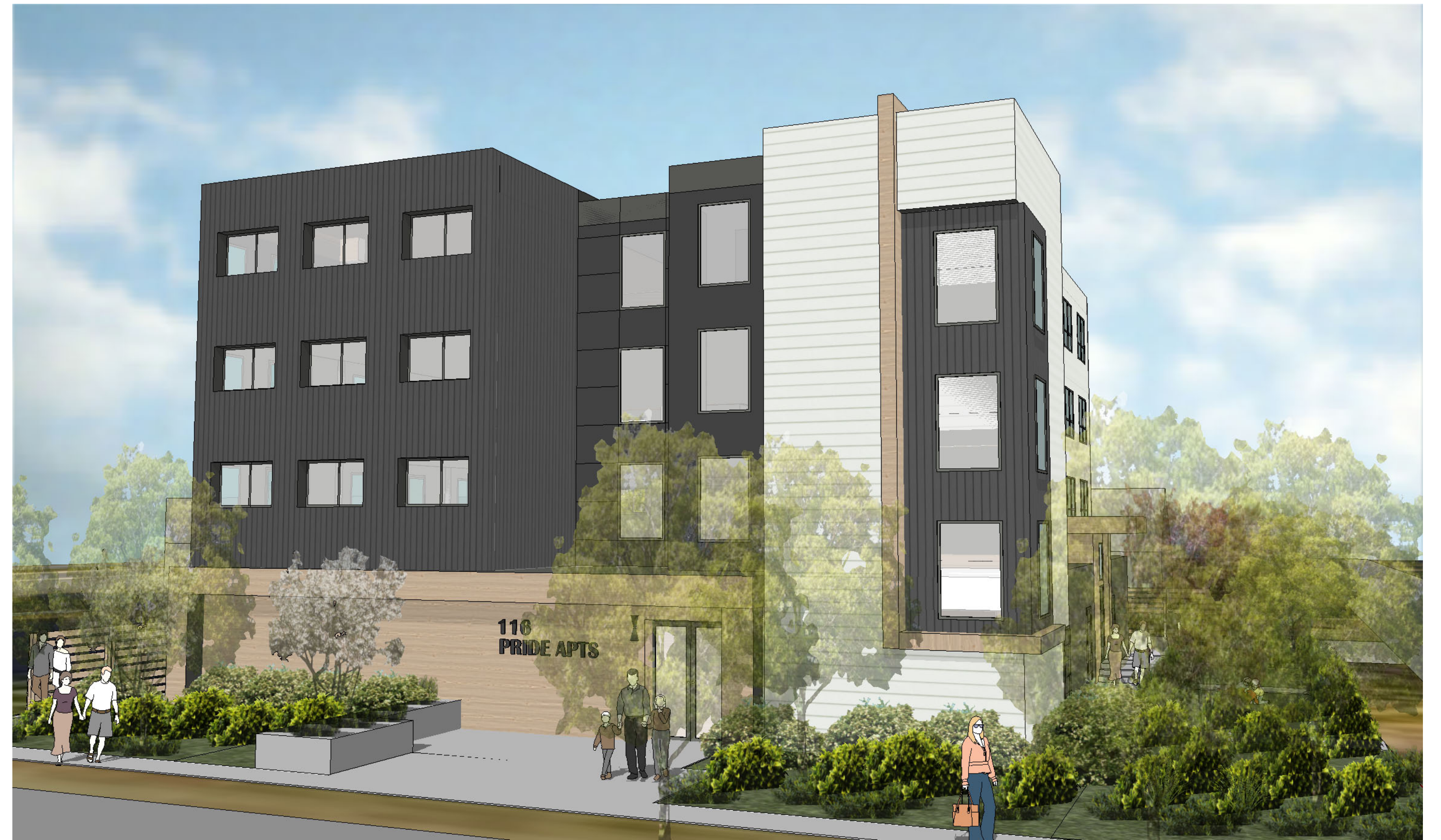
FRONT VIEW FROM PRYDE AVE