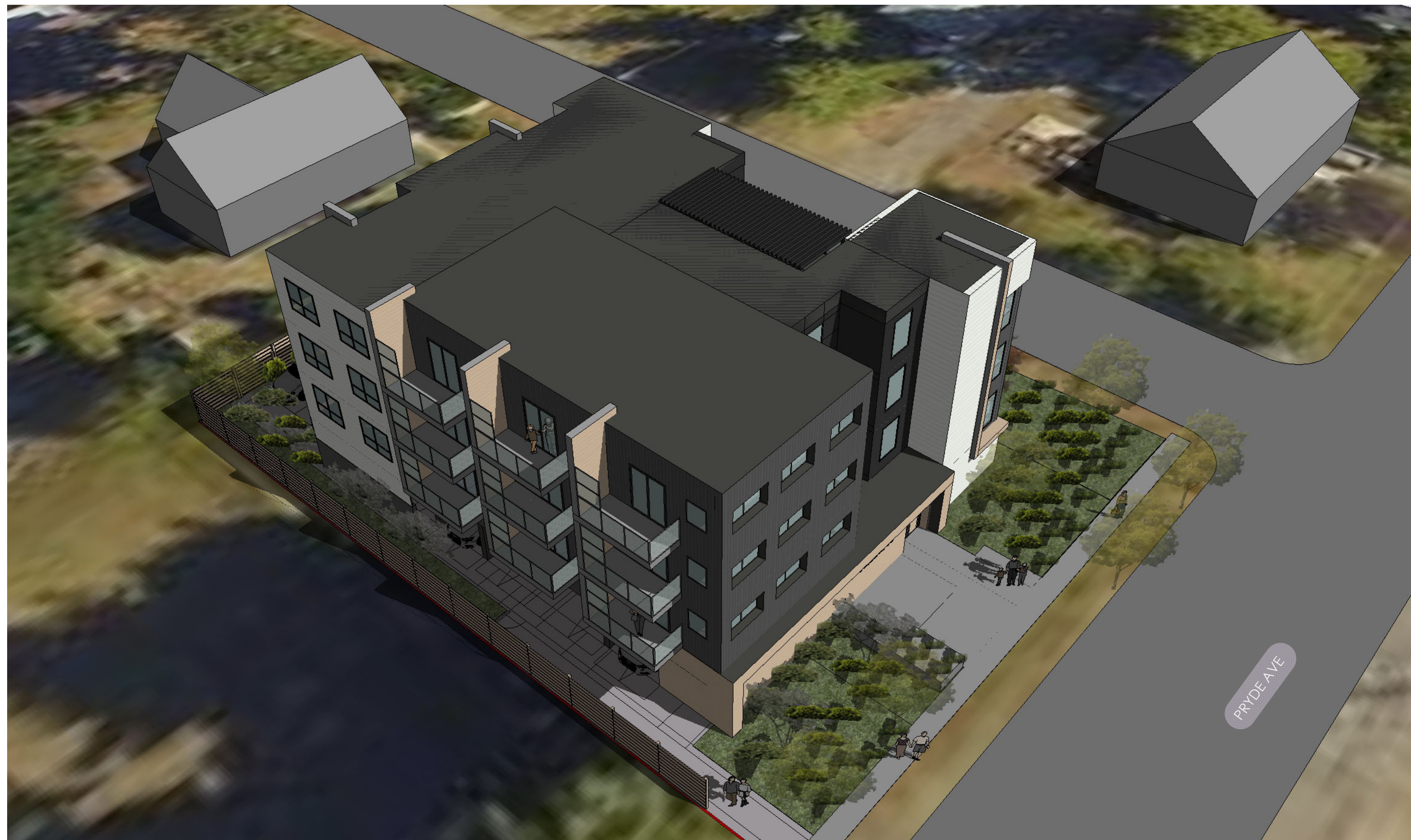
AERIAL VIEW OF SITE (FRONT/ NORTH SIDE)